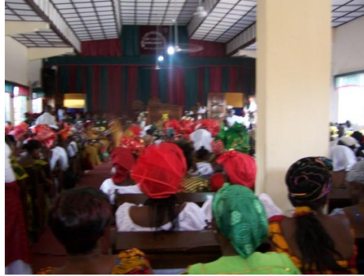
Right: Standing room only at Worldwide Mission

We returned to the USA on Monday February 7 th after travelling about 21 hours in route from Roberts International Airport (including an almost 3 hour delay) outside of Monrovia to Accra, Ghana then across the Atlantic Ocean to Atlanta, GA and connecting to Philadelphia (just made it!).